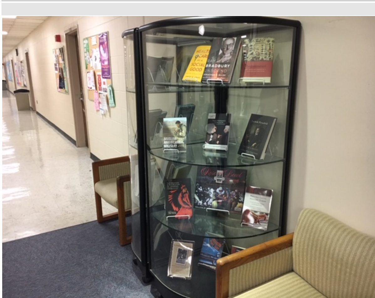
Showcasing recent faculty publications